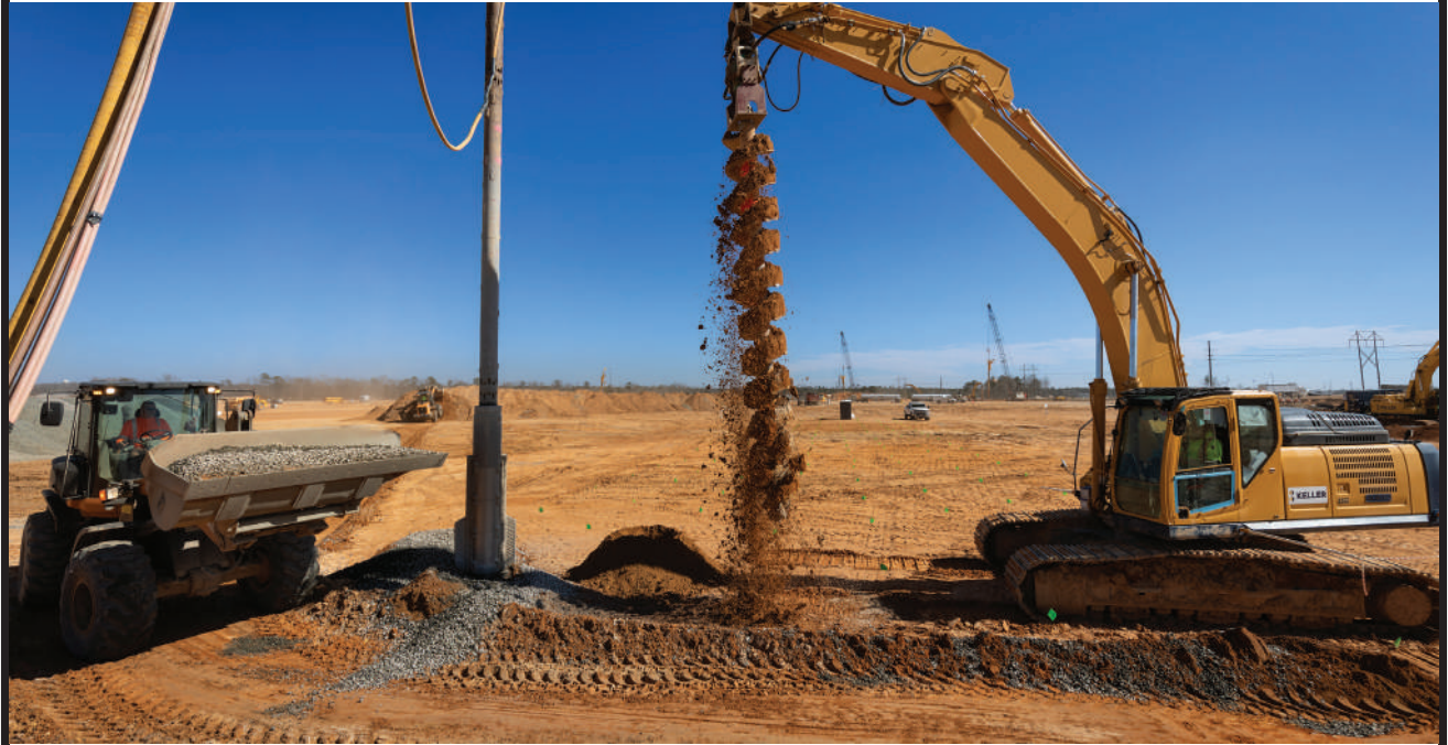
Keller North America ( No. 17 ) is providing ground improvement services over approximately 15 million sq ft of building pads on the $2-billion Scout Motors electric vehicle plant in Blythewood, S.C. The primary scope of work is the installation of aggregate piers with varying depths of 5-30 ft. The facility is scheduled to start production in 2026.